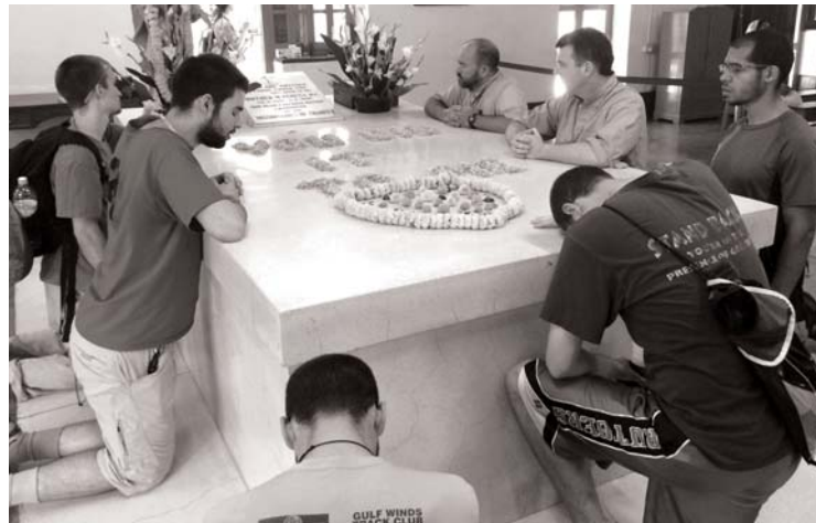
POWERFUL PRAYERS. Throughout the trip the men relied on the intercession of Blessed Mother Teresa. Here, they kneel at her tomb.

One brother had the opportunity to feed a man on the brink of death from starvation and see how he progressed in health over the course of our time there. For him, this experience was a profound metaphor for the life and mission of the Brotherhood. When we meet students, they are often spiritually starving. Like a physically starving man, we must feed them spiritual nourishment: the love of