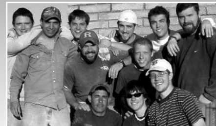
BAND OF BROTHERS. "By the end of the week, we were pretty tight, dude."

the center of all of our lives and reminded our hearts of the calling to assist our fellow man, as Jesus taught us, "...whatever you did for one of these least brothers of mine, you did for me" (Mt. 25:40).